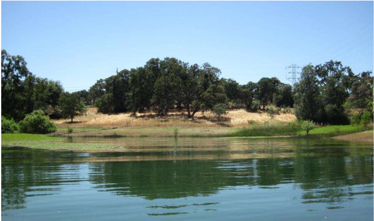
Figure 19. Camp Far West Reservoir, Auditory Survey Site 3. June 29, 2017.