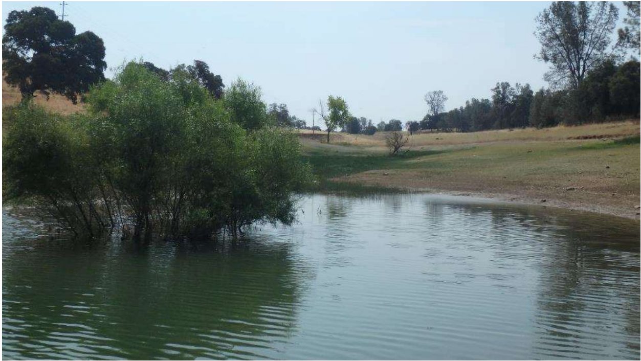
Figure 15. Camp Far West Reservoir, Auditory Survey Site 2. August 3, 2017.