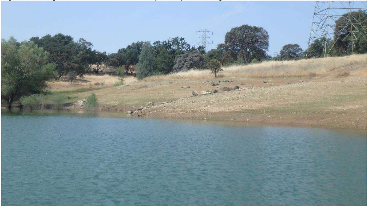
Figure 22. Camp Far West Reservoir, Auditory Survey Site 3. August 3, 2017.