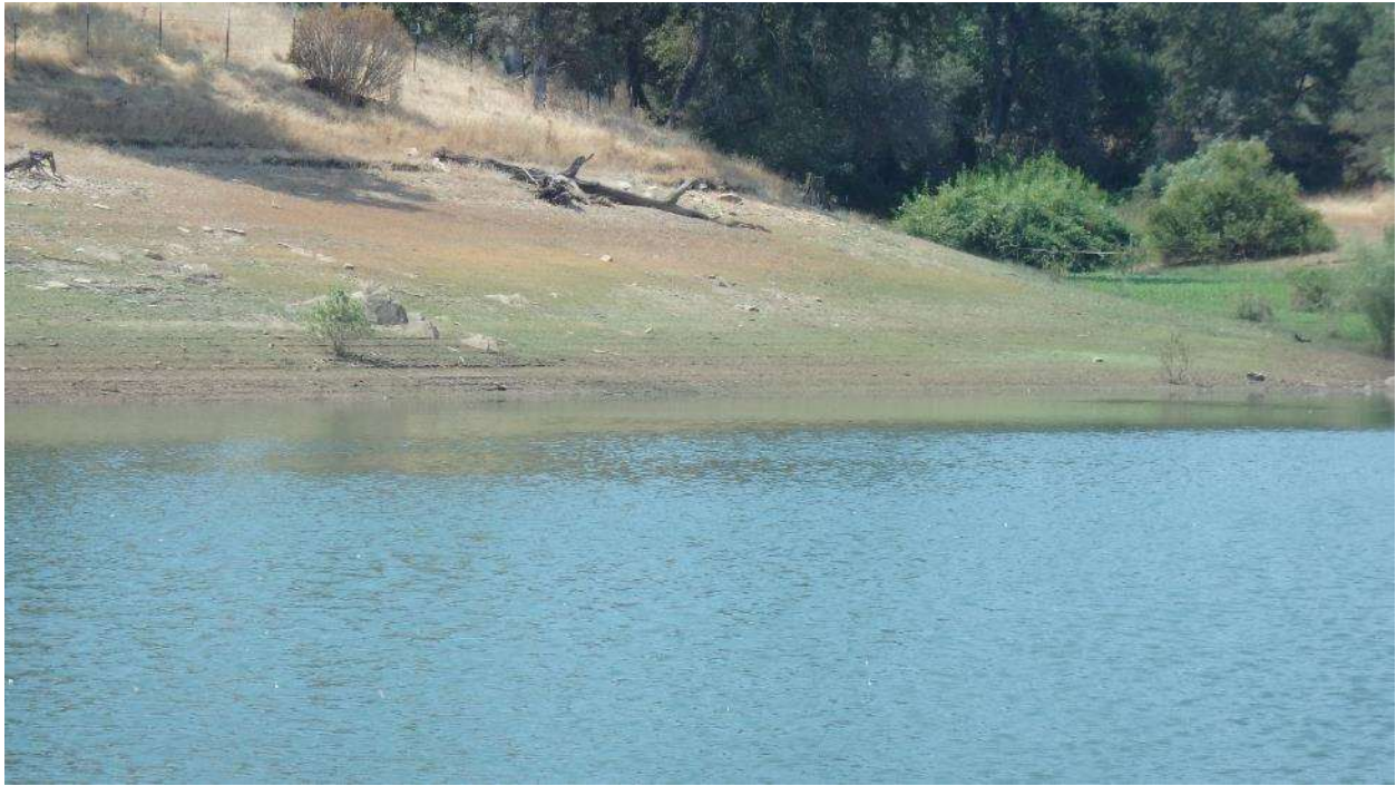
Figure 21. Camp Far West Reservoir, Auditory Survey Site 3. August 3, 2017.