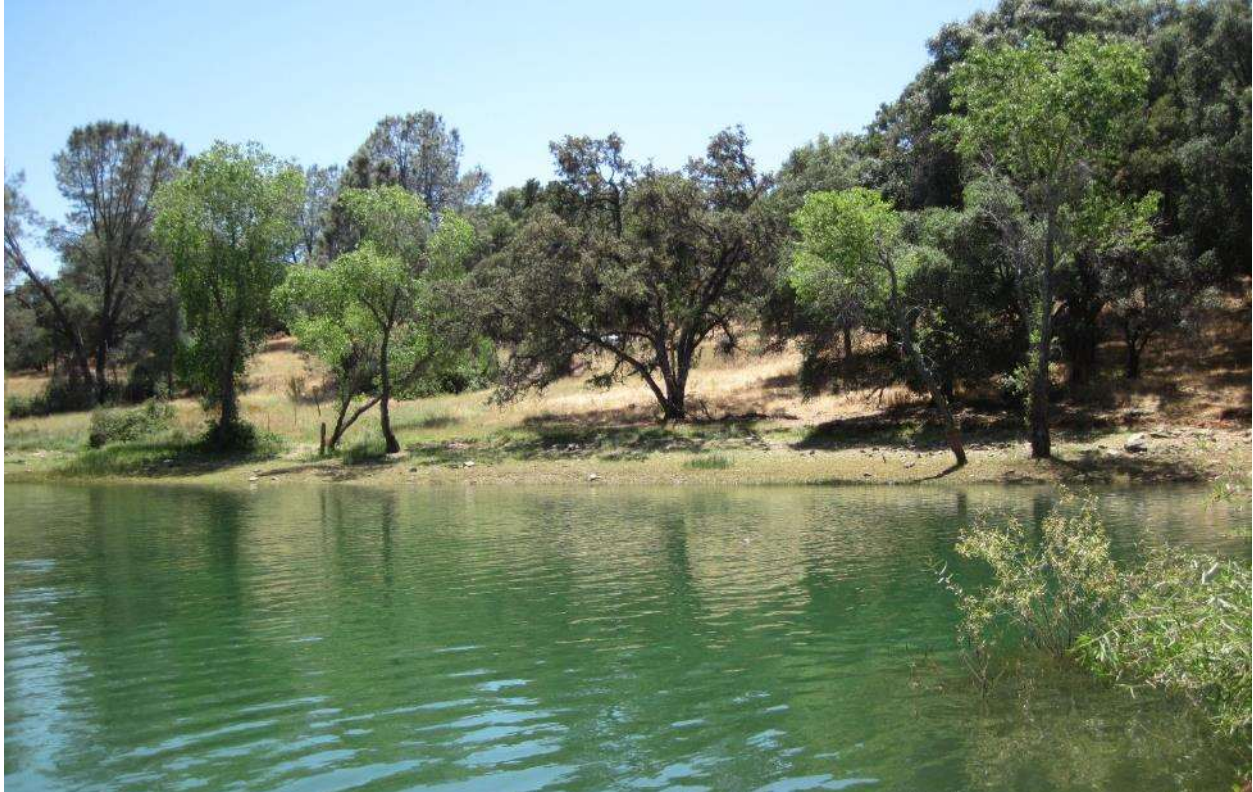
Figure 14. Camp Far West Reservoir, Auditory Survey Site 2. June 29, 2017.