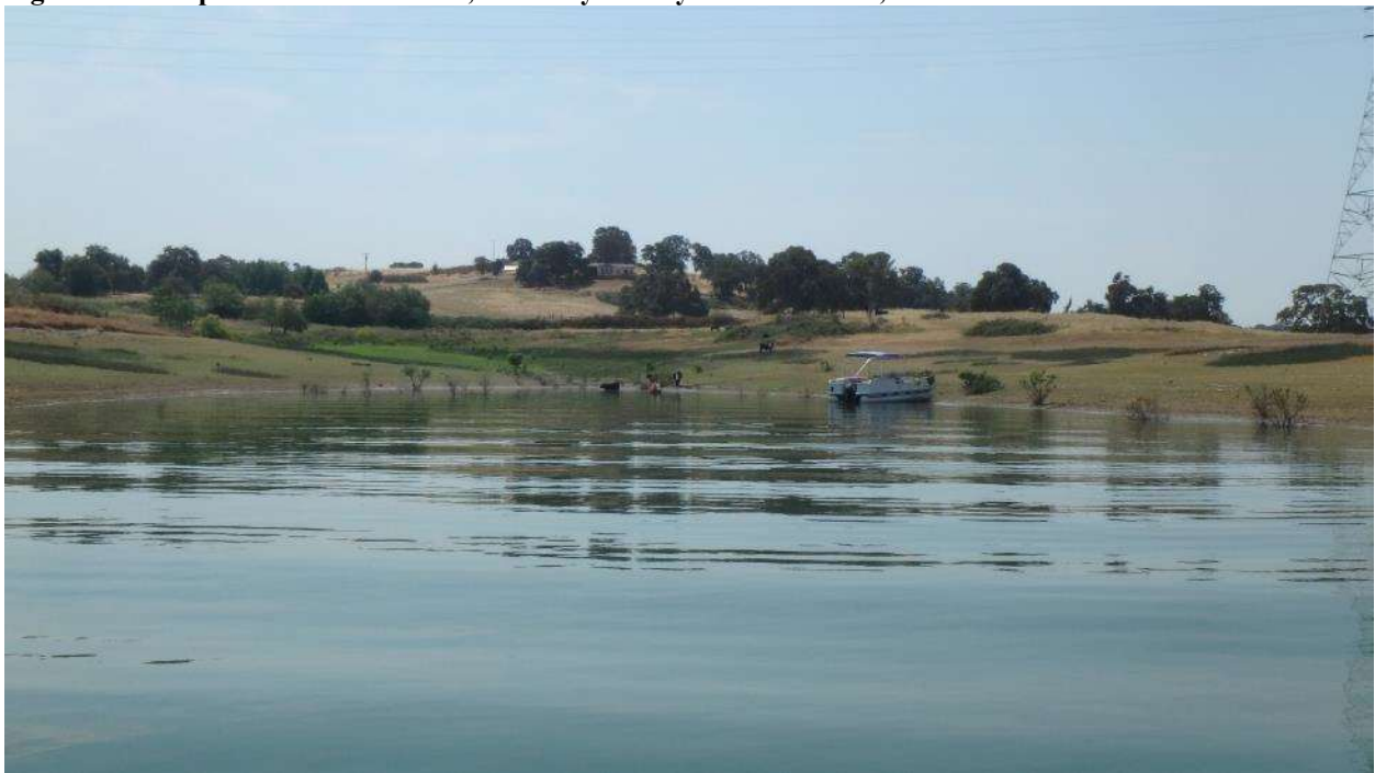
Figure 28. Camp Far West Reservoir, Auditory Survey Site 5. August 3, 2017.