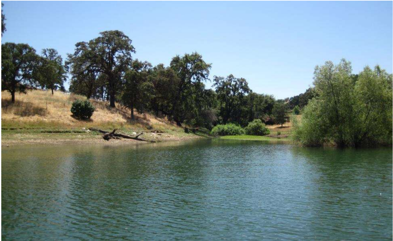
Figure 17. Camp Far West Reservoir, Auditory Survey Site 3. June 29, 2017.