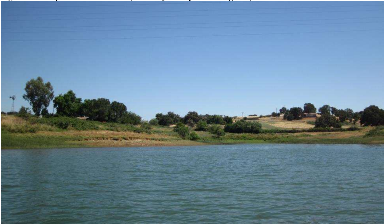
Figure 26. Camp Far West Reservoir, Auditory Survey Site 5. June 29, 2017.