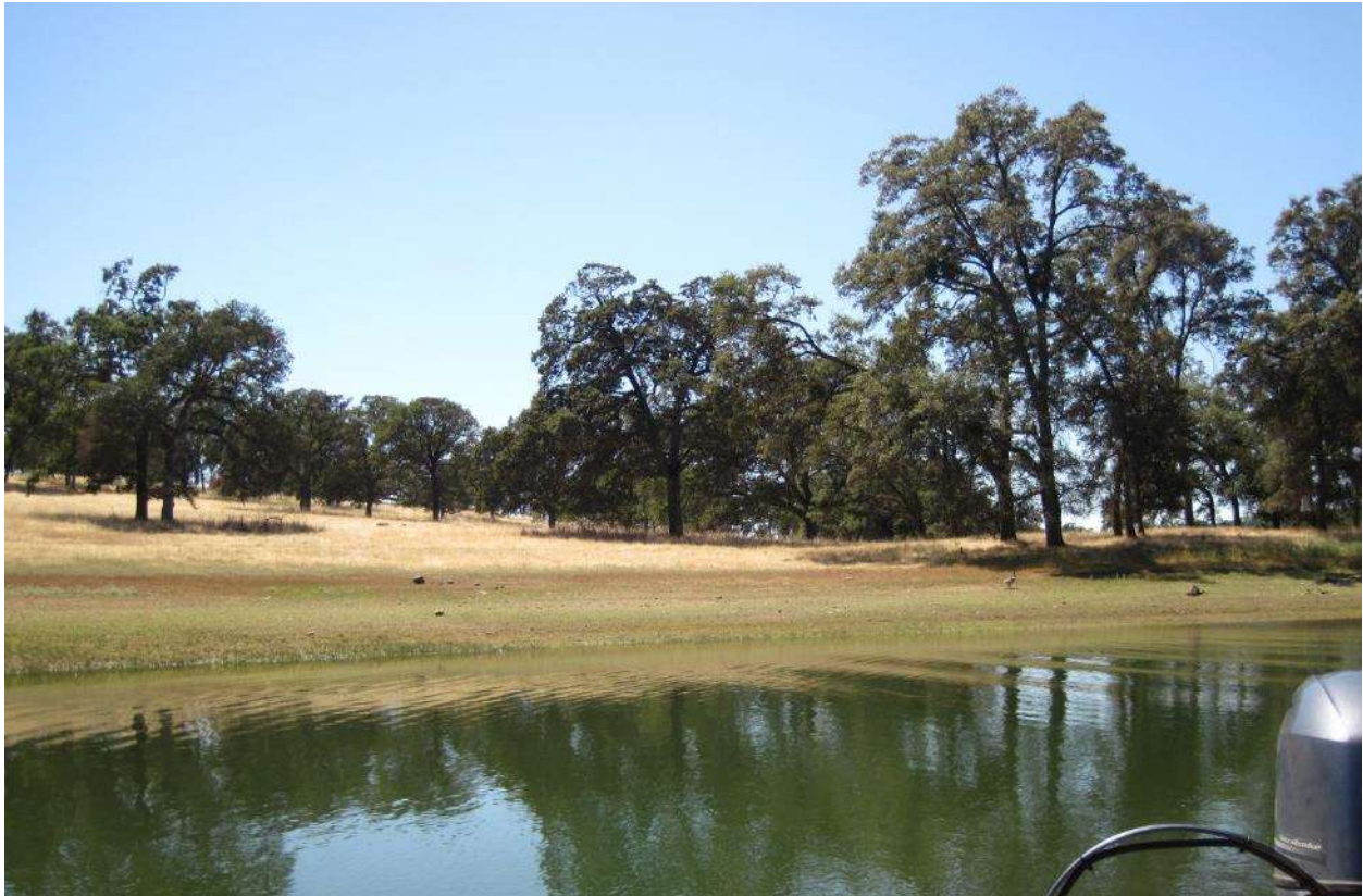
Figure 31. Camp Far West Reservoir, Auditory Survey Site 6. June 29, 2017.