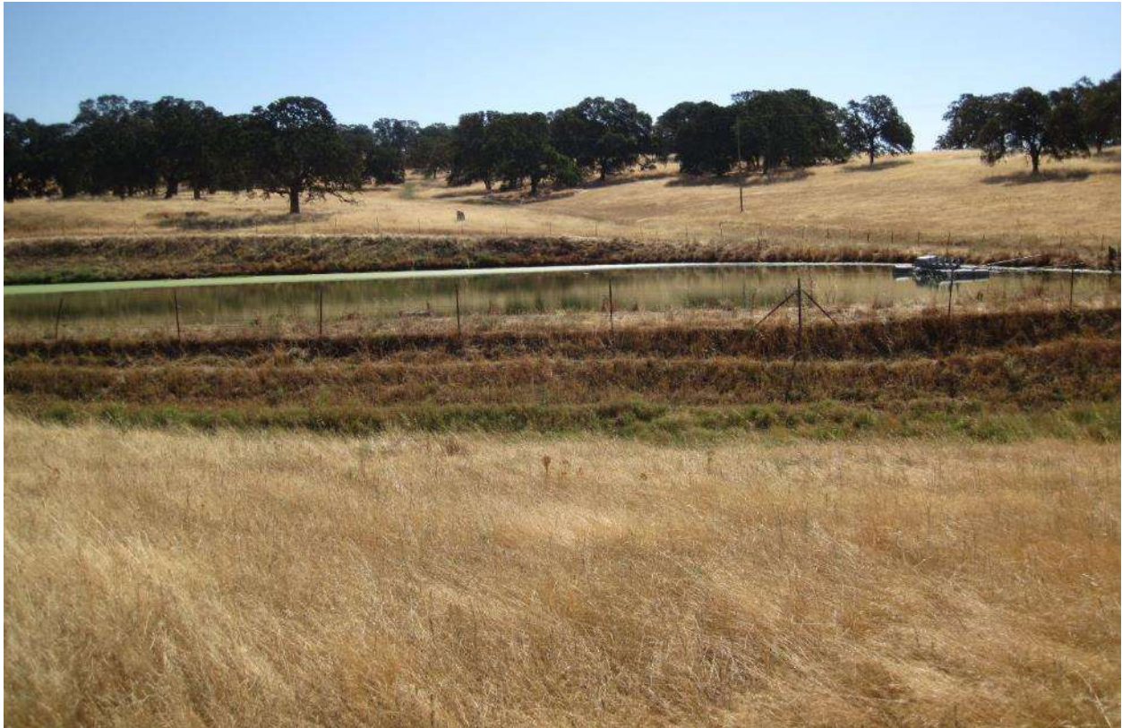
Figure 1. North Shore Recreation Area sewage pond. June 29, 2017.