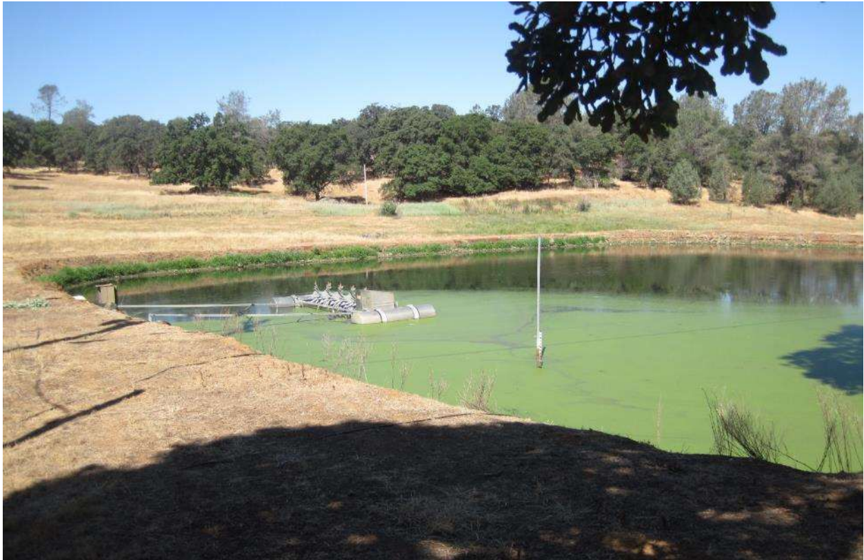
Figure 5. South Shore Recreation Area sewage pond. June 29, 2017.