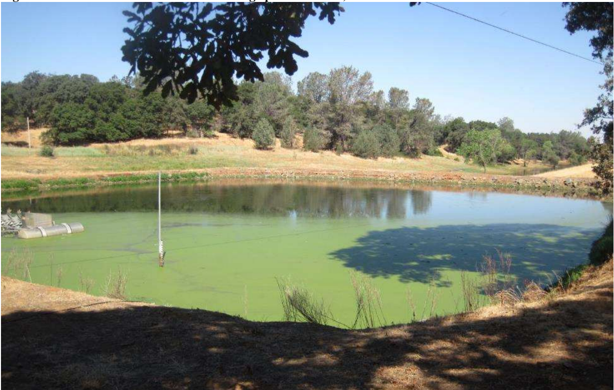
Figure 4. South Shore Recreation Area sewage pond. June 29, 2017.