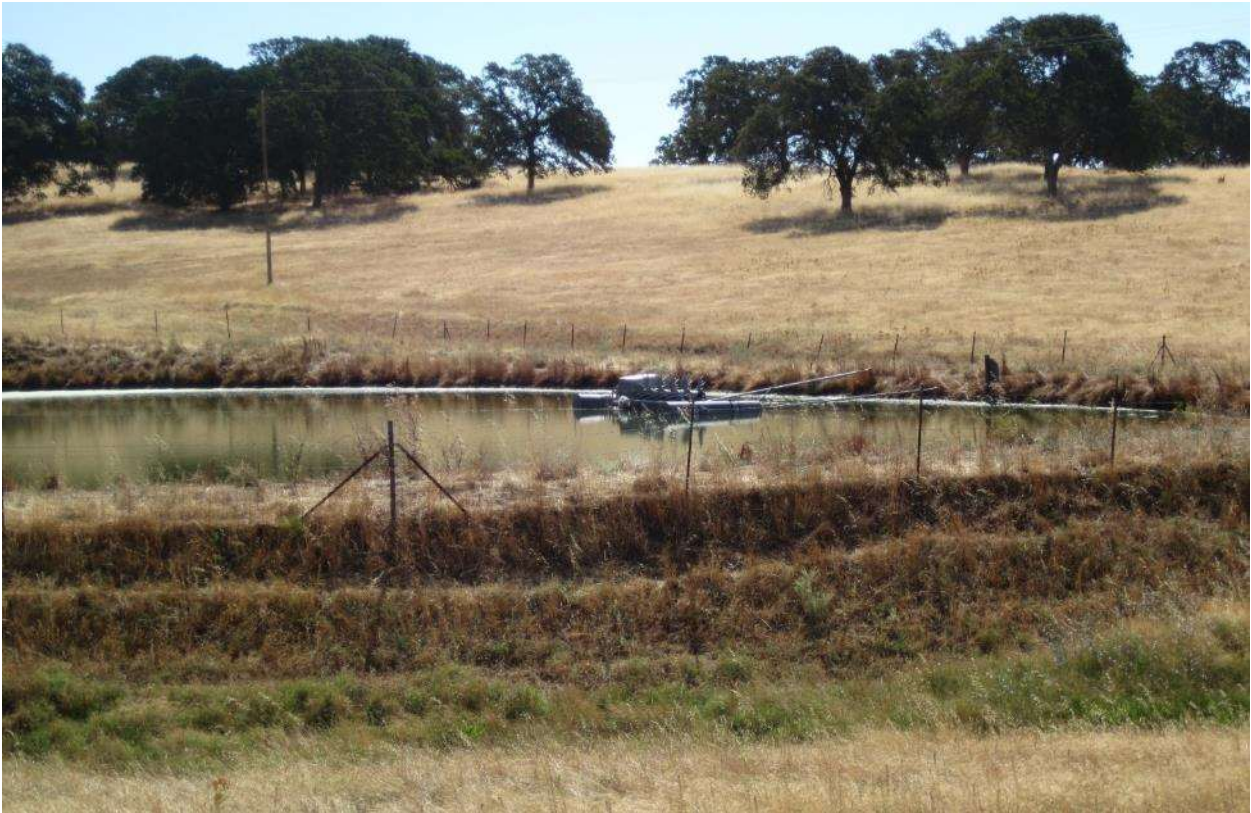
Figure 3. North Shore Recreation Area sewage pond. June 29, 2017.