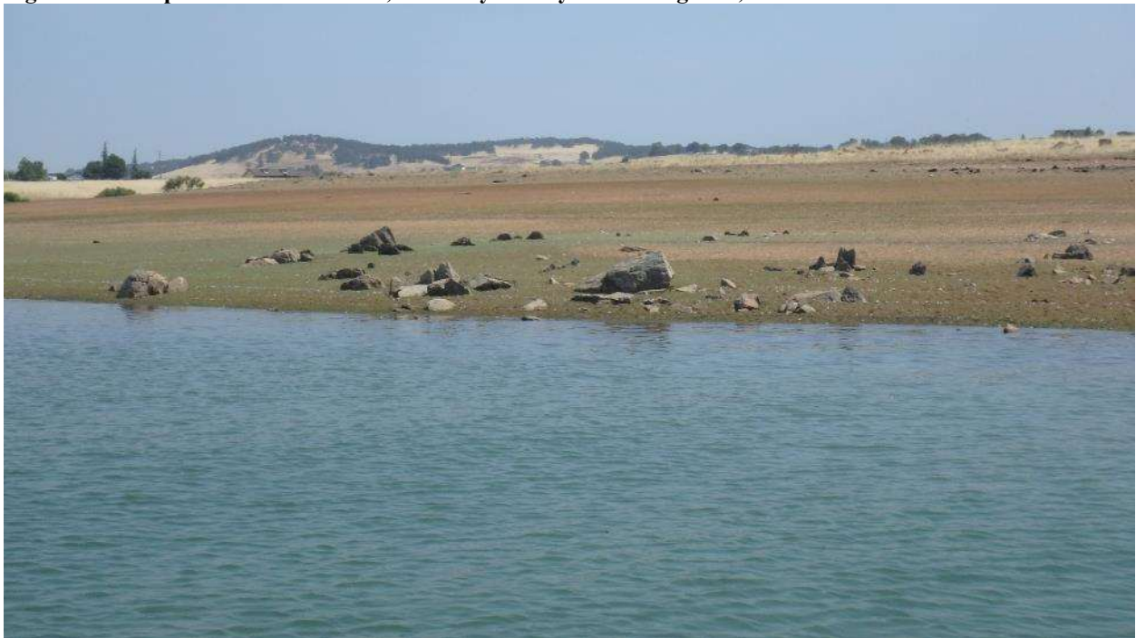
Figure 12. Camp Far West Reservoir, Auditory Survey Site 1. August 3, 2017.