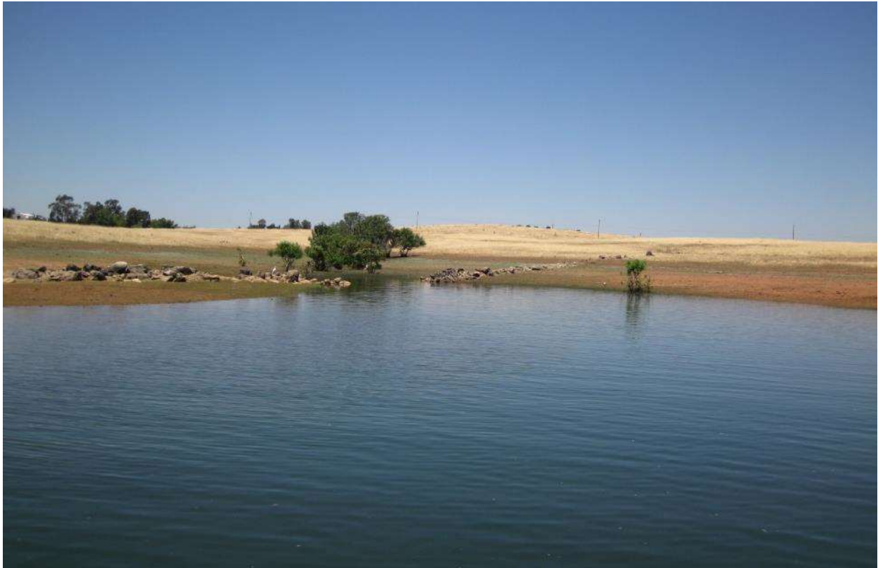
Figure 9. Camp Far West Reservoir, Auditory Survey Site 1. June 29, 2017.