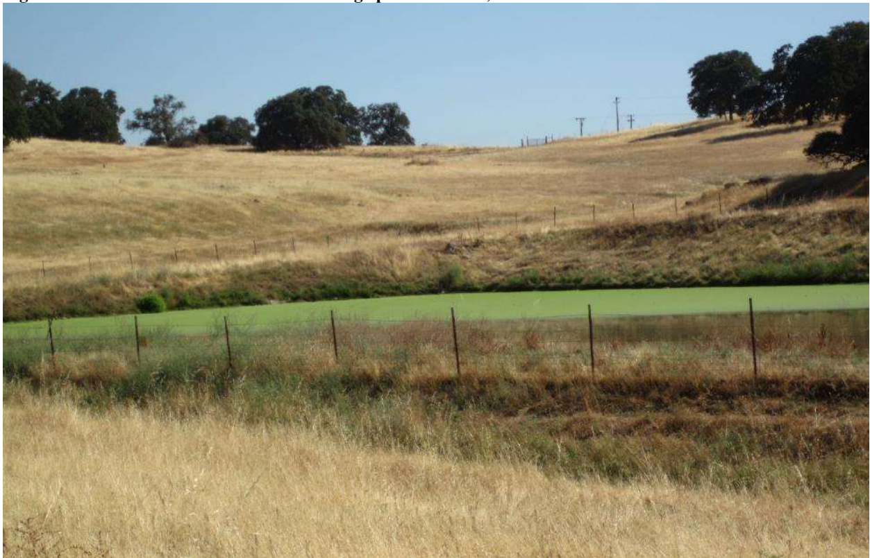
Figure 2. North Shore Recreation Area sewage pond. June 29, 2017.