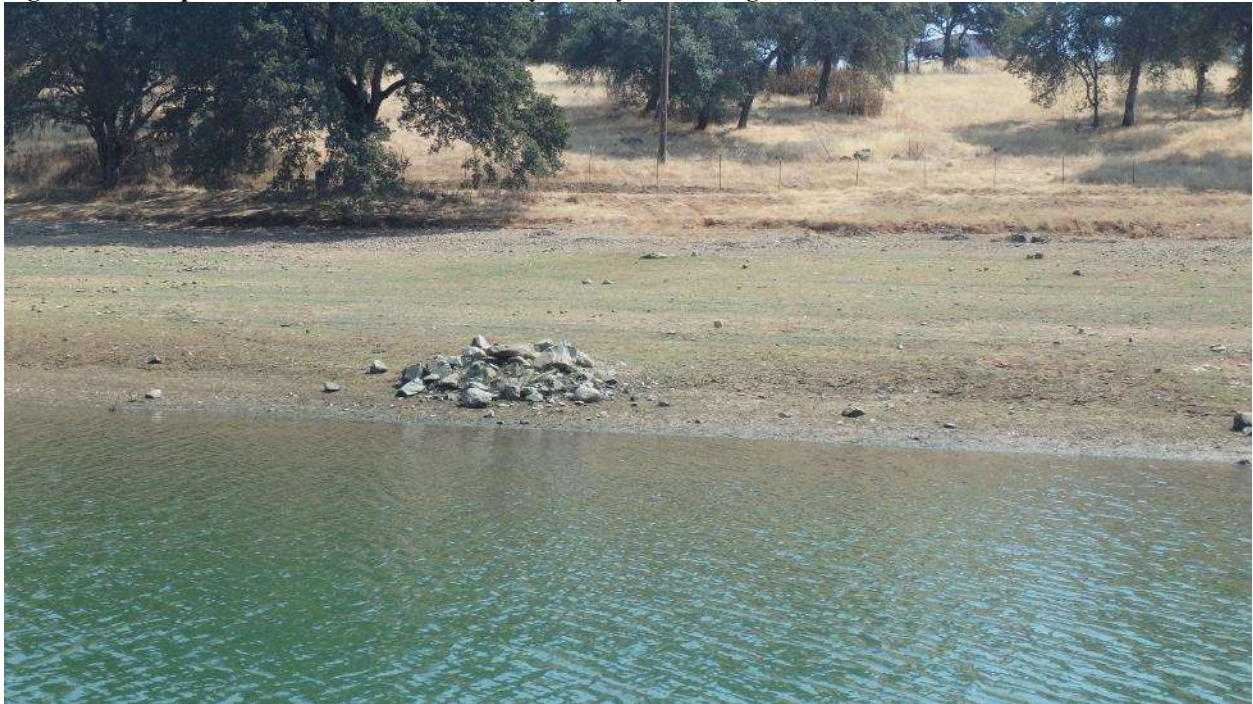
Figure 16. Camp Far West Reservoir, Auditory Survey Site 2. August 3, 2017.