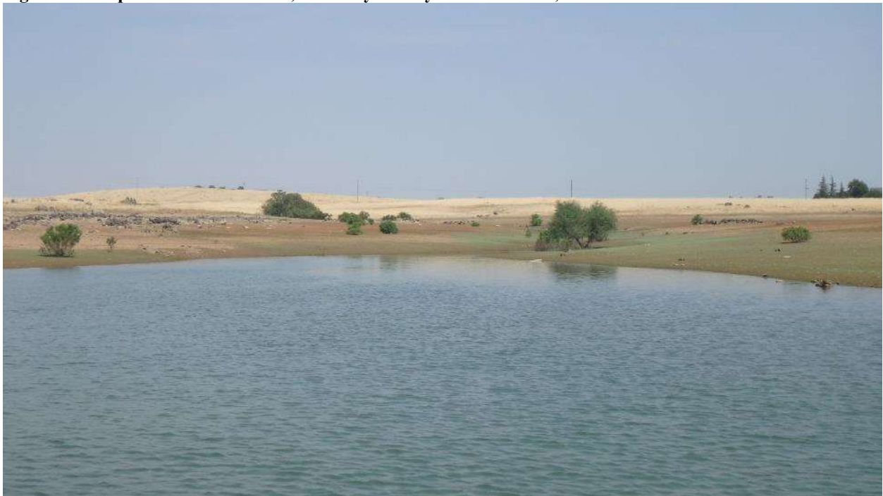
Figure 10. Camp Far West Reservoir, Auditory Survey Site 1. August 3, 2017.