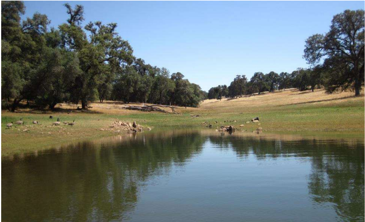
Figure 29. Camp Far West Reservoir, Auditory Survey Site 6. June 29, 2017.