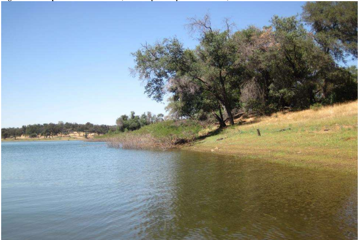
Figure 30. Camp Far West Reservoir, Auditory Survey Site 6. June 29, 2017.