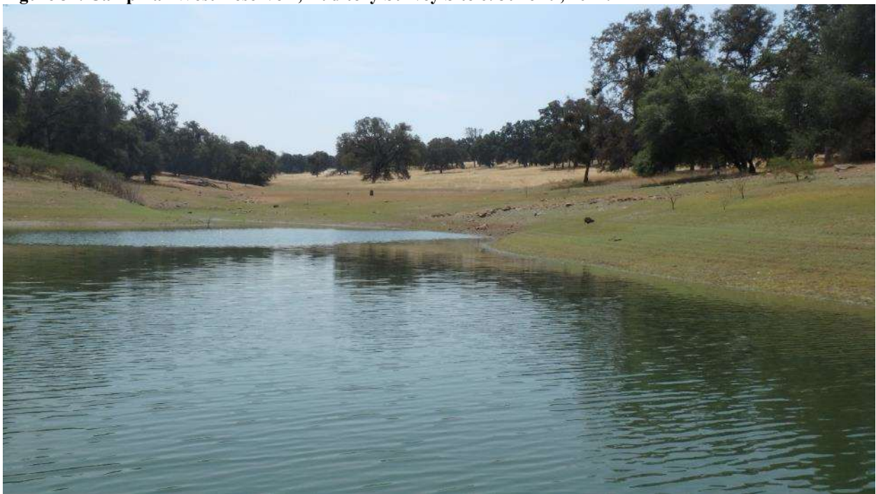
Figure 32. Camp Far West Reservoir, Auditory Survey Site 6. August 3, 2017.