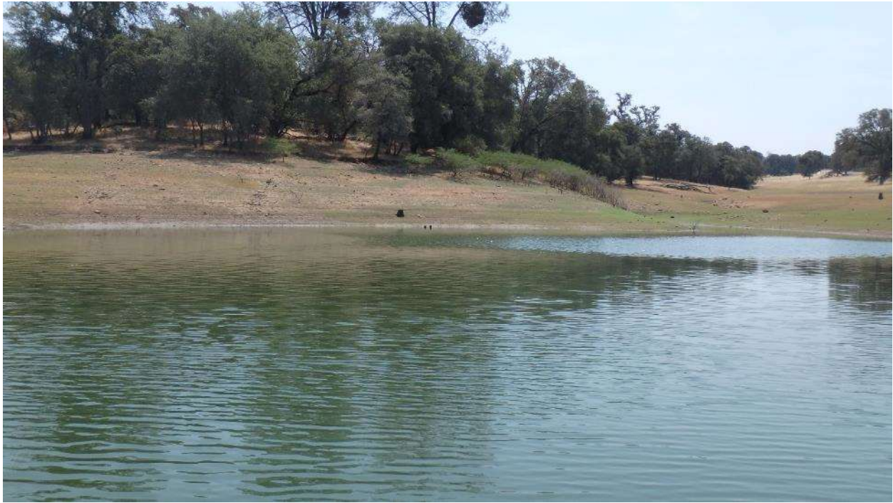
Figure 33. Camp Far West Reservoir, Auditory Survey Site 6. August 3, 2017.