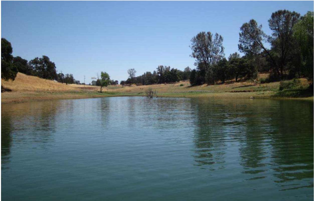
Figure 13. Camp Far West Reservoir, Auditory Survey Site 2. June 29, 2017