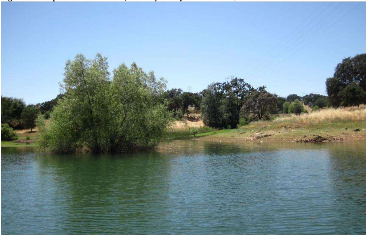
Figure 18. Camp Far West Reservoir, Auditory Survey Site 3. June 29, 2017.