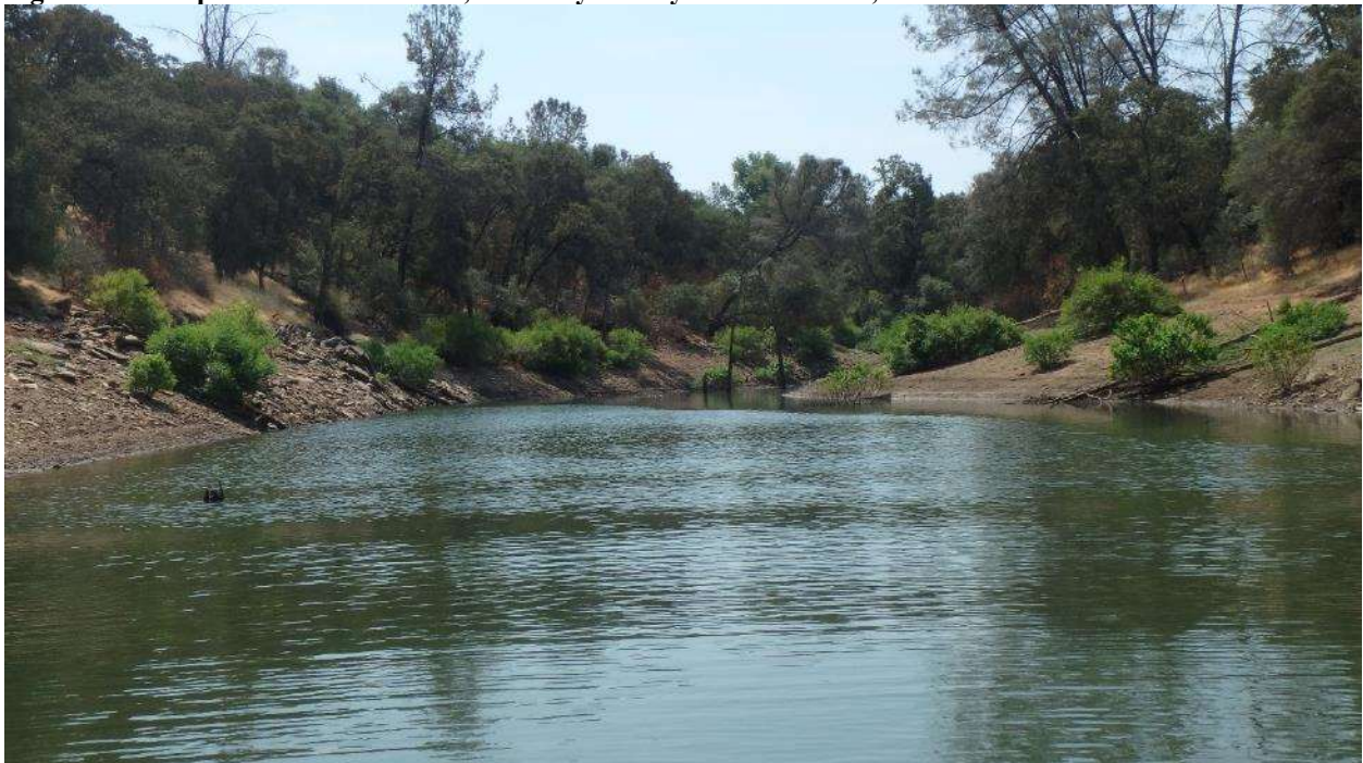
Figure 24. Camp Far West Reservoir, Auditory Survey Site 4. August 3, 2017.