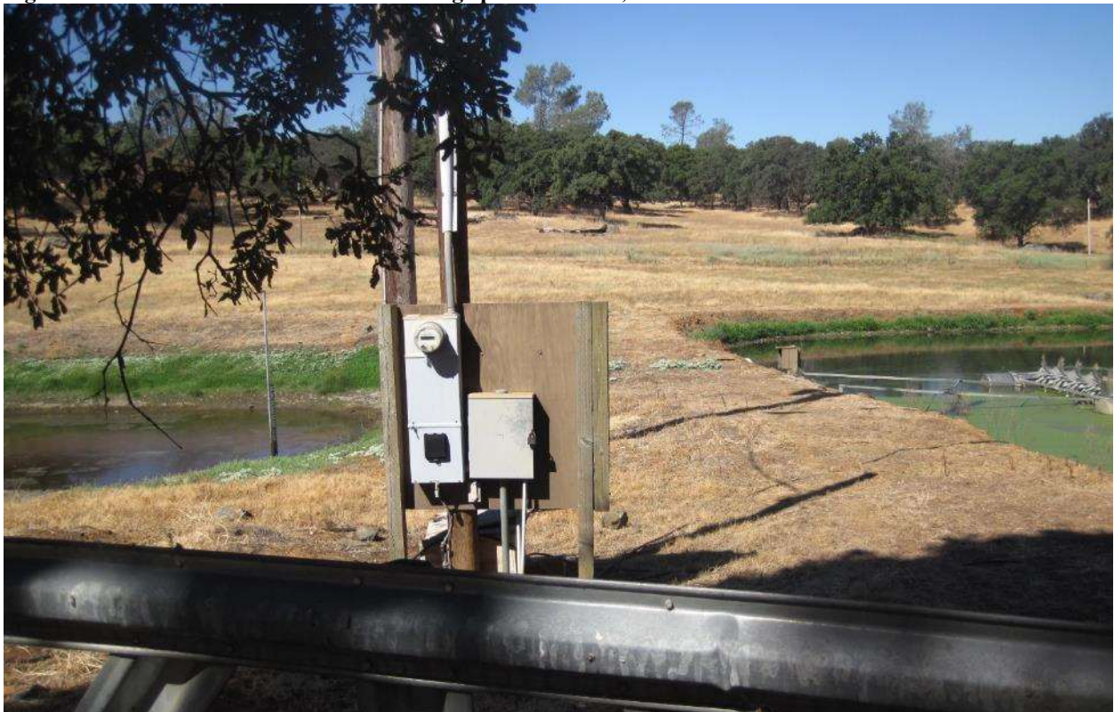
Figure 6. South Shore Recreation Area sewage pond. June 29, 2017.