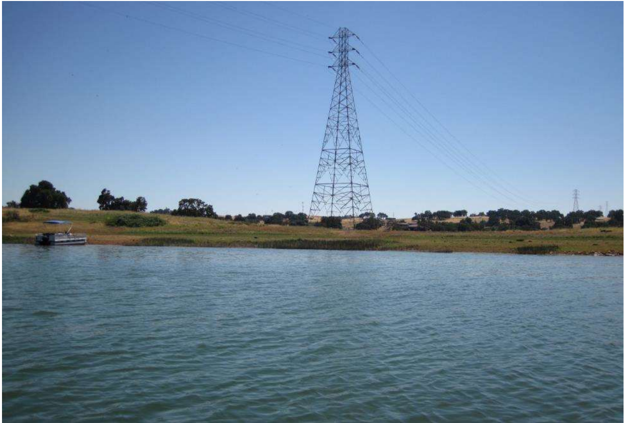
Figure 27. Camp Far West Reservoir, Auditory Survey Site 5. June 29, 2017.