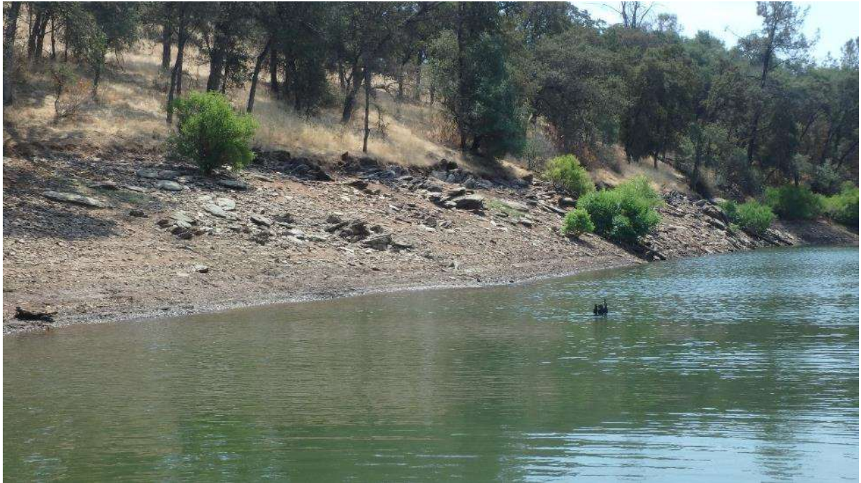
Figure 25. Camp Far West Reservoir, Auditory Survey Site 4. August 3, 2017.