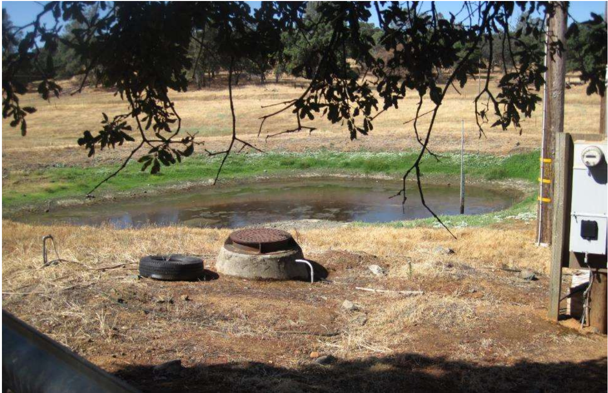
Figure 7. South Shore Recreation Area sewage pond. June 29, 2017