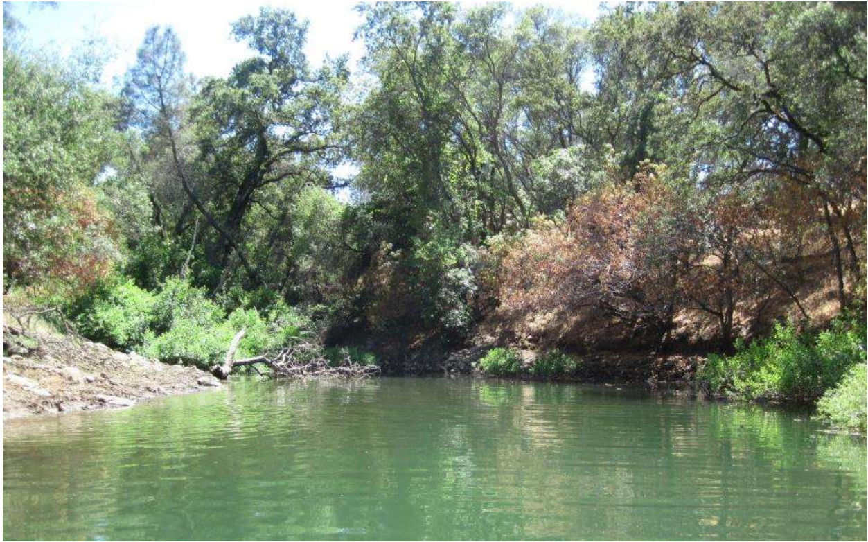
Figure 23. Camp Far West Reservoir, Auditory Survey Site 4. June 29, 2017.