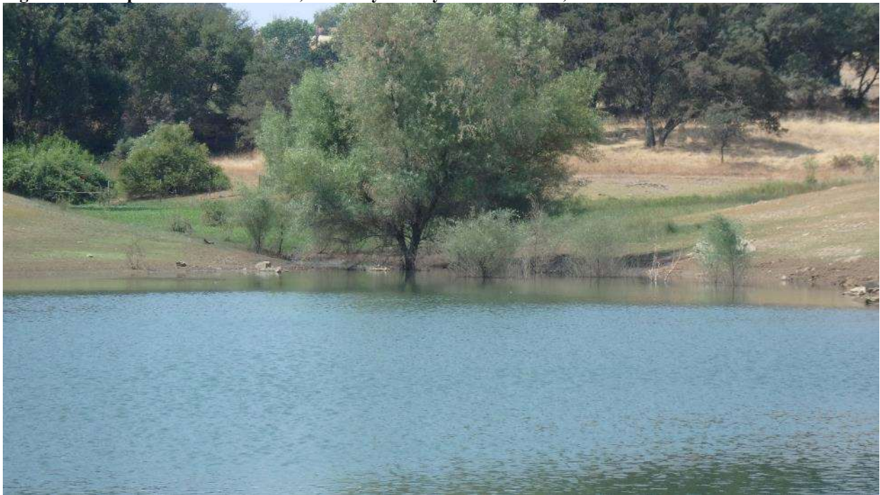
Figure 20. Camp Far West Reservoir, Auditory Survey Site 3. August 3, 2017.