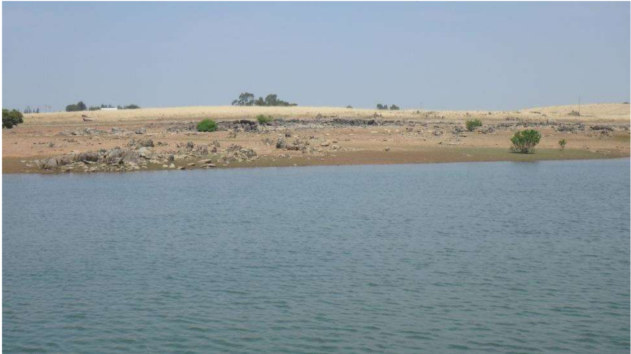
Figure 11. Camp Far West Reservoir, Auditory Survey Site 1. August 3, 2017.